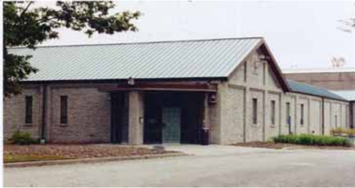
The Library opened to the public on October 29, 1933