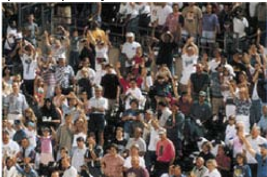
Apprentices and their families

It's Saturday, July 28 th , 7:15 p.m. and here's the opening pitch. The crowd continues to pour into Harbor Park to see the Norfolk Tides face the Ottawa Lynx. The stadium is filled with fans, and the special guests tonight are the students of the Northrop Grumman Apprentice School, their families, and their friends. It's Tides Night for the Apprentice School.