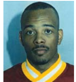
Apprentice School 1997

"Every day you should give your best possible effort; the rest will come with time."