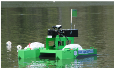
Below: Sink Oar Swim II ATC – Virginia Beach, VA