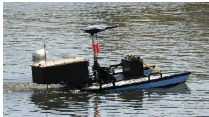
Below: Smooth Sailing ATC – Virginia Beach, VA