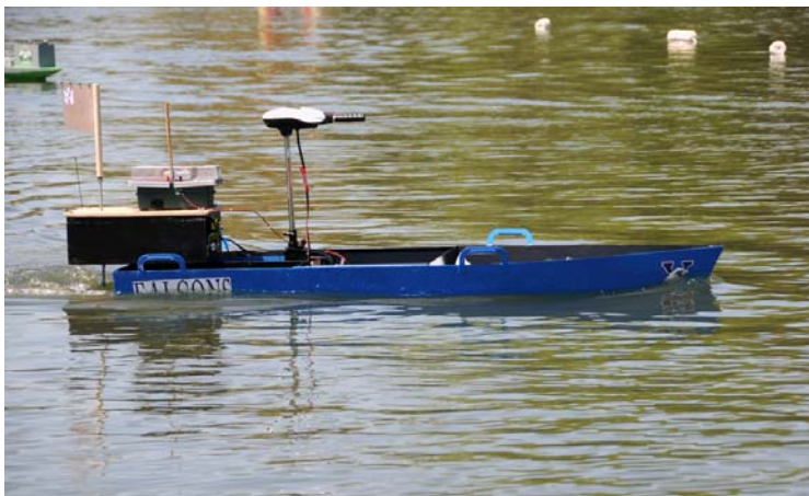
Above: The 2009 SNAME Boat Competition winners team Falcons, York High School, Yorktown, VA