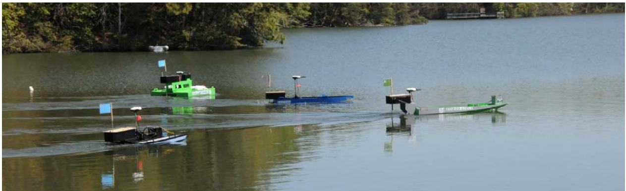
Above: Integrated Aluminum earned the "Speed Freak" boat decal for being the fastest boat.